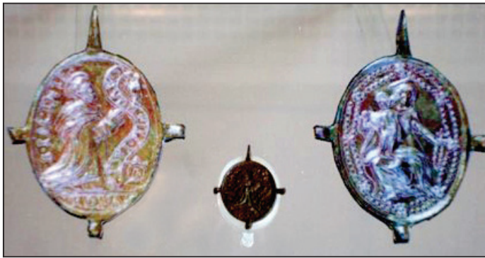
This medal was found in Jamestown archaeological digs recently and was on display in the exhibit hall. St. Hyacinth is a Polish saint canonized in 1594, highly revered with many churches in Poland and abroad bearing his name. It is assumed that the medal was brought to Jamestown by Polish tradesmen in 1608.