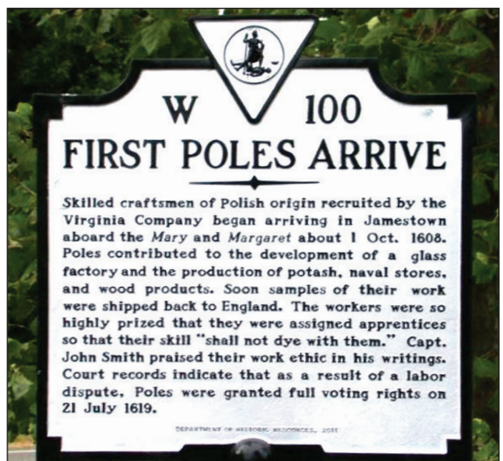
America's first civil rights action for the right to vote, Jamestown Colony July 21, 1619

The Virginia Company court records dated 21 July 1619 stated: "Upon some dispute of the Polonians resident in Virginia, it was now agreed (notwithstanding any former order to the contrary) that they shall be enfranchized, and made as free as any inhabitant there whatsoever". And because their skill in making pitch & tarr and soap-ashes shall not dye with them, it is agreed that some young men, shall be put unto them to learne their skill & knowledge therein for the benefit of the Country hereafter." This record also established America's first Apprentice Program.