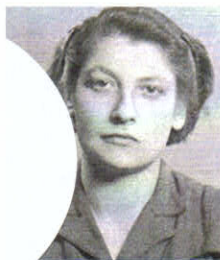
Zivia Lubetkin 1914-1976

The only woman on the High Command of the Resistance group Żydowska Organizacja Bojowa , Lubetkin was one of the leaders of the Warsaw Ghetto Uprising and led a group of fighting survivors through