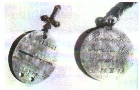
Polish medallions recovered from Katyń.

and Secret Police (NKVD), recommended to Stalin and the Politburo that 25,700 prisoners be executed in order to deprive the future state of Poland a large part of its military and educated talent. The killings took place at the Katyń forest itself, in camps, in jails, and wherever the Soviets were holding these Poles on the death lists.