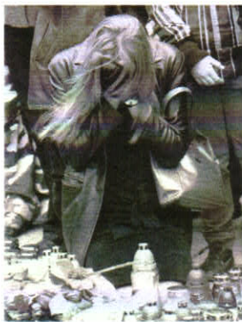
A nation in mourning.

There are also effects of this tragic event nobody could expect. In a matter of days, Katyń has become a place recognized world-wide and many people have learned why the collective memory of the Katyń massacre casts a deep shadow on Polish