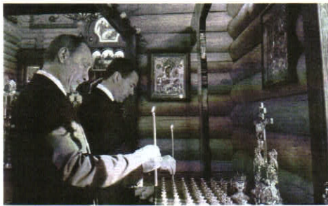
Russian President & Prime Minister lighting candles for the dead.

However, nothing indicates that democracy in Poland is in any imminent danger. All government offices are functioning normal-