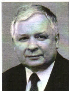
Polish President Lech Kaczyński

On April 10, 2010, a plane carrying Polish President Lech Kaczyński and his wife Maria along with 94 others crashed while coming in to land in the dense fog near a Russian airport near