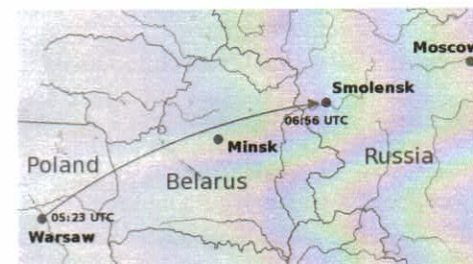
Path of the ill-fated flight.

Nobody can measure today all the consequences of this catastrophe. Parliamentary opposition, the armed forces and the newly