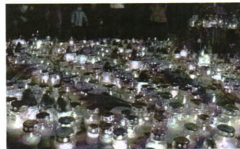
Thousands of candles were lit in front of the Presidential Palace.

brought by planes to Poland, they were buried with all the honors in state funerals across the country. The central commemoration of the dead took place in Warsaw's Piłsudski Square and was