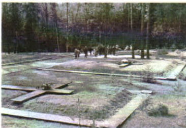
Mass graves at Katyń.

In 1941, the Polish Government in Exile in Great Britain signed an agreement with the Soviets to create a Polish