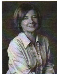
First Lady Maria Kaczyńska

Smoleńsk. The President and the other members of the official Polish delegation were heading to Katyń in western Russia to commemorate the 70th anniversary of the massacre of 22,000 Polish officers captured by the Soviet Red Army after they and Nazi Germany attacked Poland in September 1939.