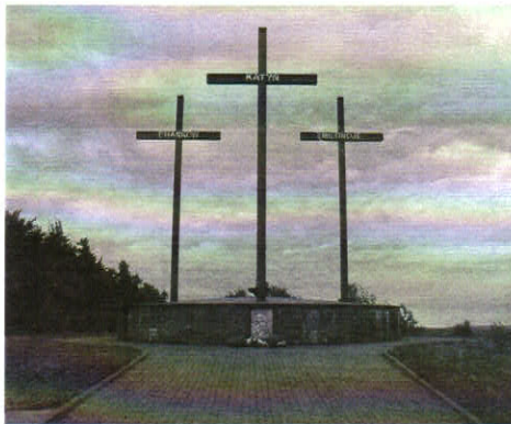
Crosses at Katyń.

between the two countries. On September 1st Germany invaded Poland from the south, west and north and on