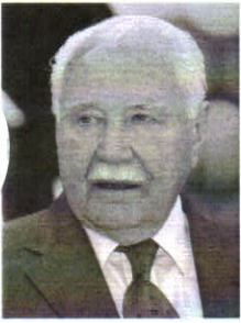
Ryszard Kaczorowski Last Polish President in Exile

Kaczorowski was born November 26, 1919, in Białystok. Captured and exiled by the Soviets at the beginning of the Second World War, he joined General Władysław Anders' Army. After the war he remained in Great Britain as a member of the