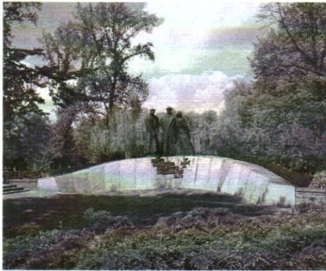
Katyń Memorial in Katowice.

lawyers, engineers, and teachers, more than 100 writers and journalists, as well as about 200 pilots.