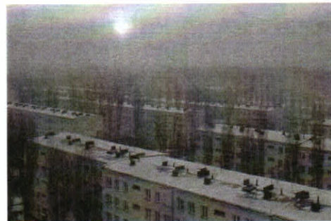
Nowa Huta apartment architectural design had little regard for human life and safety.