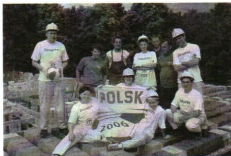
Volunteers from around the world.

Habitat for Humanity in Poland focuses on both the construction of modest, yet decent, homes for low-income families, and renovating large apartment blocks. Removing fire and general safety hazards