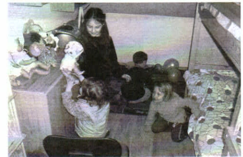
Children in their new dream room.

In the town of Józefosław, Habitat hosted a "Women Build" day. The team of women-only builders included journalists, executives from Whirlpool, Habitat representatives, and national celebrities. All-star top tennis stars Agnieszka and Urszula Radwańska and Daniela Hantuchova joined in to prepare floors and paint wood for external walls. The famous tennis playing sisters also contributed tennis rackets for a charity auction. The auction raised money for Habitat's program, "Homes without Barriers," which is dedicated to serving the housing needs of Poland's disabled population.