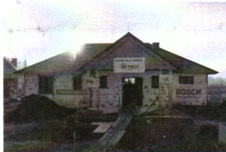
Dom dla Braci.

When Poland entered the free market, the influx of jobs and money was like a growth hormone injected into a young man. Although immediate progress was seen, the country experienced powerful growing pains, as in 2004 when housing and land prices increased by 100%. The push to boost the economy, like in today's 22% tax on home renovations, often made matters worse and more than just a topical salve was needed to ease the discomfort felt by Poles. Habitat's work is like that of a physical therapist stretching the country's muscles and re-tooling old practices. Working with the new system of government and Europe's powerful volunteer base, Habitat is having success.