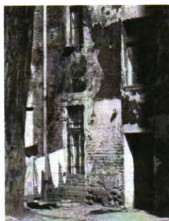
Example of sub-standard housing.