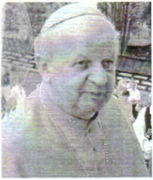
Stanislaw Cardinal Dziwisz Catholic Prelate

Born in 1939 in Raba Wyżna, just north of Nowy Targ, he entered seminary in Kraków and was ordained in 1963 by then Bishop Karol Wojtyła. In 1966, he was appointed personal secretary to