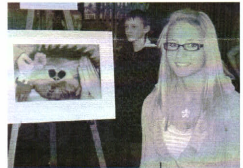
Top: Polish students and their chaperones visiting Łomianki Park in Columbia Heights.