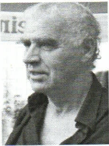
Janusz Głowacki Playwright born September 13, 1938 Poznań, Poland

NONPROFIT ORG. U.S. POSTAGE PAID MINNEAPOLIS, MN PERMIT NO. 31798