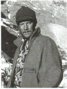
Jerzy Kukuczka Alpinista 1948–1989

Born in Katowice. Considered one of the most outstanding mountain climbers in the world. Second man in the world to capture the “Crown of the Himalayas” for climbing the fourteen highest peaks in the world above