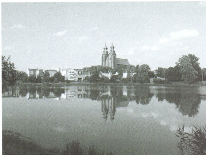
Gniezno from across the lake

Gniezno was the major city of the early Piast rulers of Poland and they made it their capital in the 10th century. When Mieszko I was baptized a Christian 966 and brought with him the early Poles, Gniezno grew in importance and one of the first bishoprics in Poland was established in that city. In 1024 Boleslaus I was crowned in Gniezno cathedral as the first King of Poland. The city was destroyed by the Teutonic Knights in 1331, suffered major fires in 1515, overrun by the Swedes in the 17th century, and was devastated by the plague in 1708, all of which led to declines in population; but by 1768 it became the seat of the Gniezno Voivodeship. In 1793 the city passed to Prussia under the Second Partition and in 1920 it became part of the Second Polish Republic.