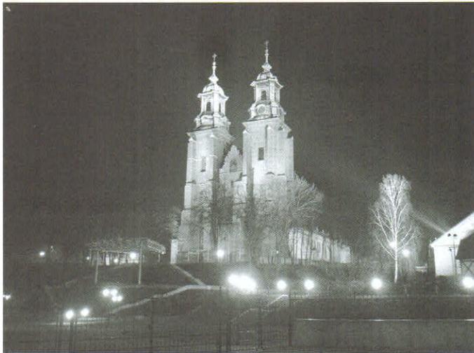
Gniezno Cathedral by night