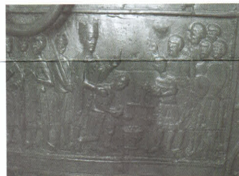
The ransom of Saint Adalbert