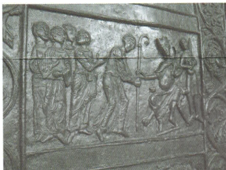
Adalbert Becomes Bishop