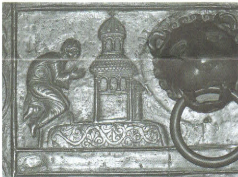
Saint Adalbert at prayer