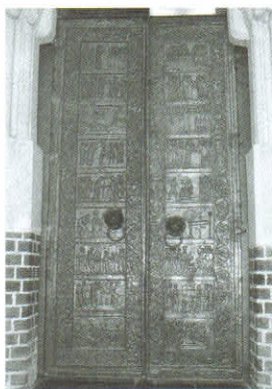
Gniezno Cathedral doors

Saint Wojciech or Adalbert is closely connected to the city. This Bishop of Prague was warmly welcomed by Bolesław I the Brave and, after a short visit, Adalbert went to Prussia along with soldiers provided by Bolesław I with the intent to bringing Christianity to the Prussian pagans. For his efforts he was martyred by the Prussians and Bolesław I reputedly ransomed the saint's body for his weight in gold. Adalbert was canonized as Saint Adalbert of Prague a few years after his death.