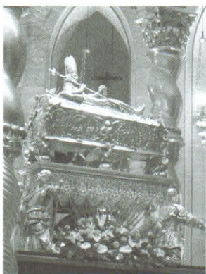
Tomb of Saint Adalbert