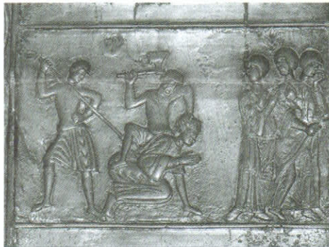
Martyrdom of Saint Adalbert