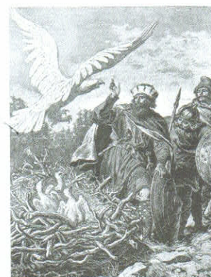
Lech, father of the Poles