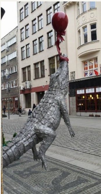
"Crocodile" for the Kalambur Theatre in Wrocław by Michał Staszczak

Mr. Staszczak invites everyone interested to visit his website www.michalstaszczak.pl and the official website of the Hot Temperatures Festival www.festiwalwysokichtemperatur.pl